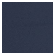
Leather TS - Florida / Dani Available colours 10