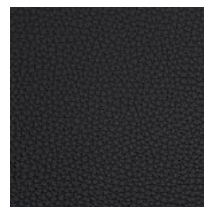
Leather SX - Box Land / Dani Available colours 12